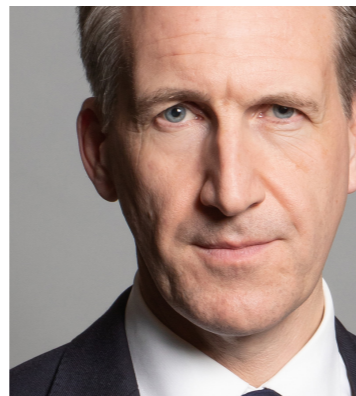
Dan Jarvis MBE MP, Mayor of the Sheffield City Region.

While we will continue to refine it, this plan is the foundation on which we hope to build our renewal.